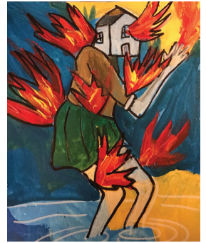
I think I am angry 2 by Rachel Coyne

APRIL 30 / 6:30pm / Franconia Sculpture Park