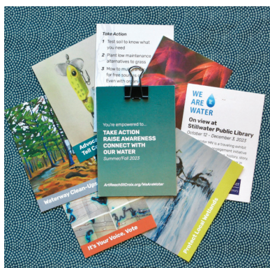
An array of Water Action Cards.

ArtReach connected 22 local voices to the We Are Water MN exhibition to humanize the information about hydrology, pollution and water conservation in Minnesota and the lower St. Croix River Valley. On view at Stillwater Public Library from October to early December, We Are Water MN is a partnership with the Minnesota Humanities Center, Pollution Control Agency and other statewide partners. Designed to engage curious minds of all ages, from water enthusiasts to experts and even our youngest