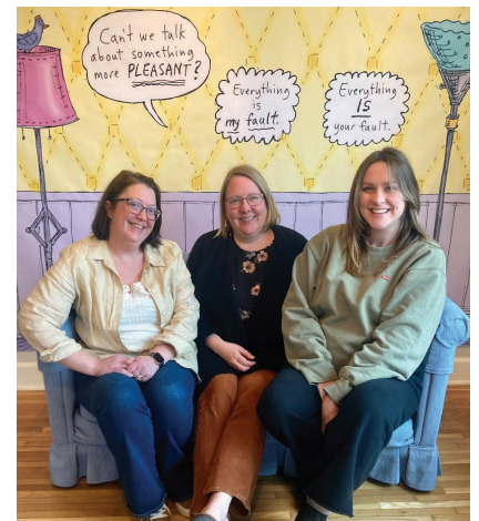
ArtReach staffers in front of the selfie wall.

A solo exhibition of original drawings by New Yorker cartoonist and author Roz Chast was on view at ArtReach St. Croix as part of the 2023 NEA Big Read which featured Chast’s book, Can’t We Talk About Something More Pleasant? The exhibit featured originals of her famous New Yorker drawings and less-famous Midwest work, all of which touched on the overarching themes connected