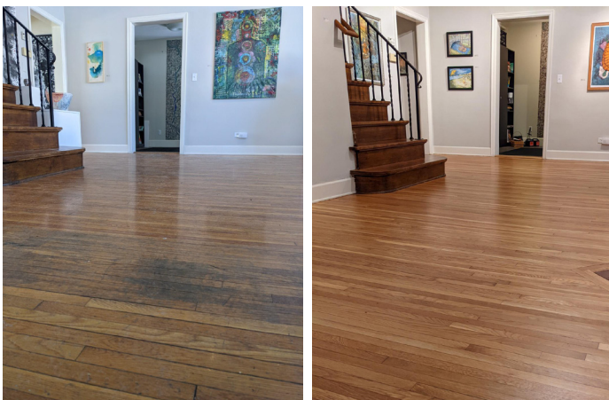
Worn floors in the gallery (left) were refinished (right)—one of the many needed improvements ArtReach was able to complete.

Thanks to each and every member artist for contributing your talents to the work we do around the Valley. You are important ambassadors for the arts.