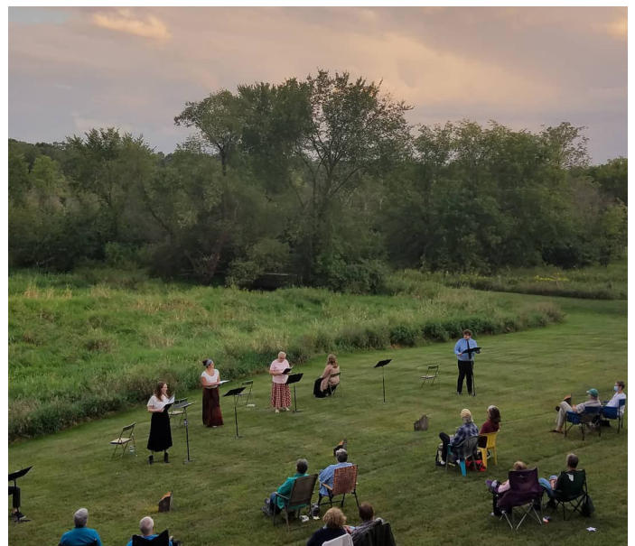
2020 NEA Big Read outdoor theater event with St. Croix Festival Theatre at St. Croix Art Barn.

NATIONAL ENDOWMENT FOR THE ARTS FOR THE BIG READ – Our community has such a passion for the literary arts that we were able to move the 2020 NEA Big Read events from their initially scheduled time in April to mid-August without lack of involvement or enthusiasm. These few months allowed time to re-plan and reimagine. We created an engaging gallery exhibition that allowed for social distancing and an outdoor reception. We hosted outdoor theatre under the summer sky and presented renowned authors and musicians online. These activities help bring a deeper understanding and fresh perspective to the selected memoir, Lab Girl by Minnesota native and paleobiologist Hope Jahren. NEA Big Read connects people to great literature and to each other in a BIG way!