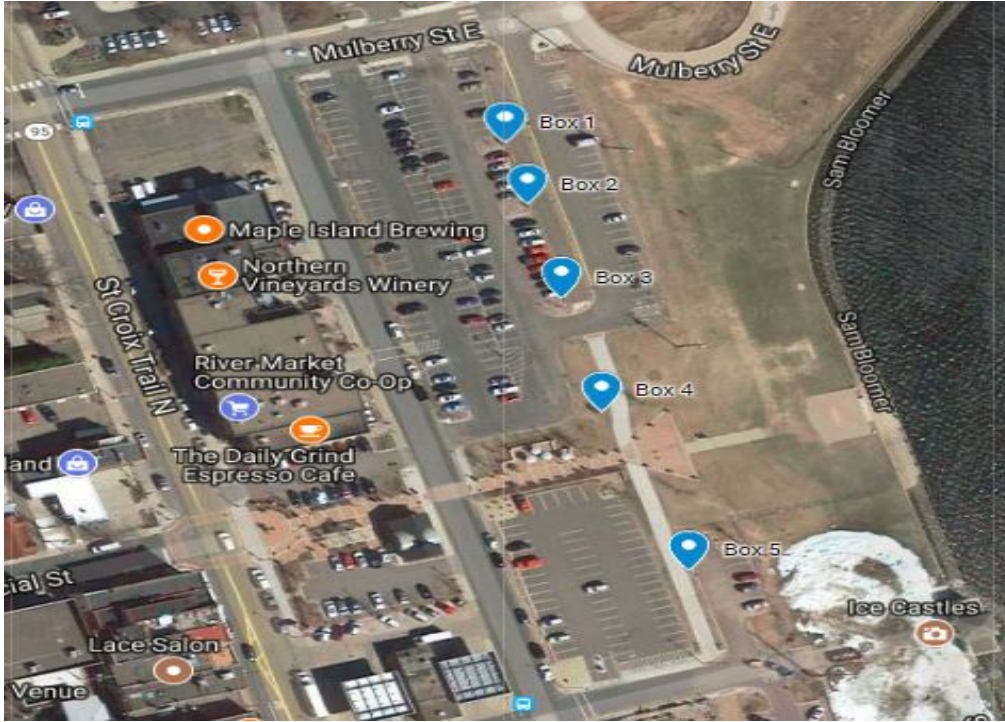
North Lowell Park Locations

Please refer to the map below to select your box.